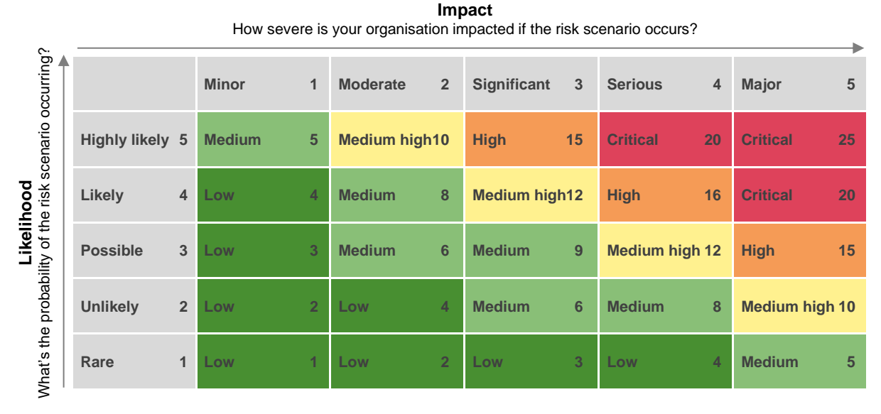
Figure 4 - Risk heat map

The resultant risk heat map that describes the inherent risk of the organisation is shown in Figure 4. A similar risk heat map is applicable for describing the residual risk of the organisation.